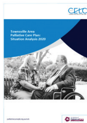
Townsville Palliative Care Plan: Situation Analysis 2020

All initiatives along with other key stakeholder interviews, kitchen table conversations and round tables provided vital information to the Townsville Palliative Care Plan: Situation Analysis 2020 which was launched in June 2020.