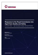
Response to the Royal Commission into Aged Care Quality and Safety

PCQ supports palliative care policy development and sector advocacy, as well as demonstrating the value of palliative care through awareness, engagement and capacity building initiatives. During 2019-2020 the PCQ policy team made several submissions to the Queensland Government and provided input into national submissions to the Commonwealth Government via Palliative Care Australia.