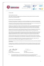
Release of Inquiry Reports into Aged Care, End-of-Life and Palliative Care and Voluntary Assisted Dying