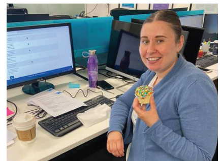
Pictured: Some of our PCQ volunteers in action