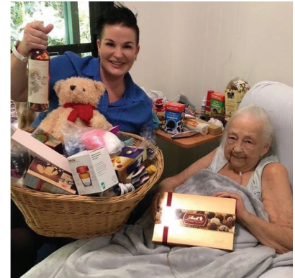
Ali's wish was to raise funds for charity