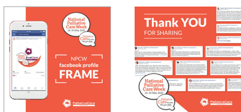
Social media campaign tiles

597 unique visits were made to PCQ's NPCW website landing page