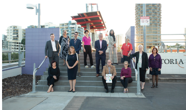
Pictured: The CELC-T team with key stakeholders from the Townsville Hospital and Health Service and Townsville City Council.