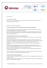
Palliative Care in Queensland: Letter to State Inquiry