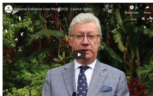
Video: Official Launch, His Excellency the Honourable Paul de Jersey AC