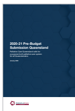
Palliative Care Queensland 2020-21 Pre-Budget Submission Queensland