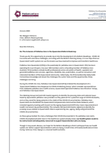
The Inclusion of Palliative Care in the Queensland Reform Roadmap