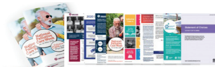
NPCW resource packs