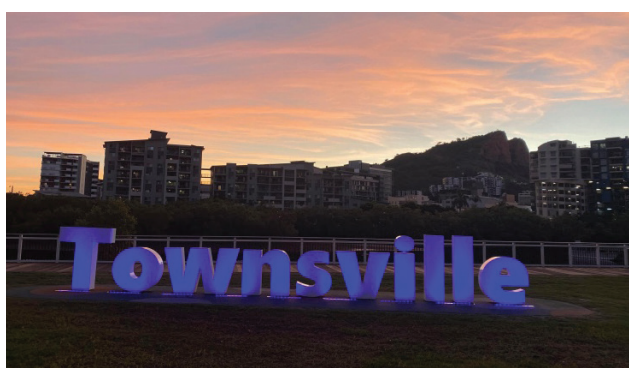
Pictured: Townsville landmark sign turned purple in support of National Palliative Care Week 2020