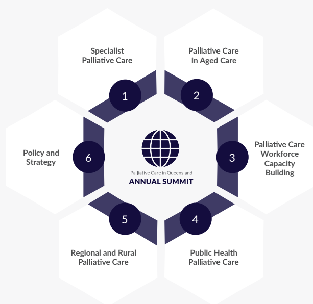
Summary of Summit 2019 Roundtables

The morning session invited representatives from key peak bodies and government agencies to speak to their organisation's current palliative care initiatives, as well as the gaps and challenges they face. Speakers were also asked to share the priorities they would encourage the palliative care sector to tackle in 2020. Next, six roundtables were held to bring together speakers, leaders and participants to debate and choose the sector priorities in six key areas: specialist palliative care; palliative care in aged care; palliative care workforce capacity building; public health approaches to palliative care; regional and rural palliative care and; policy and strategy.