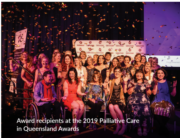
Award recipients at the 2019 Palliative Care in Queensland Awards