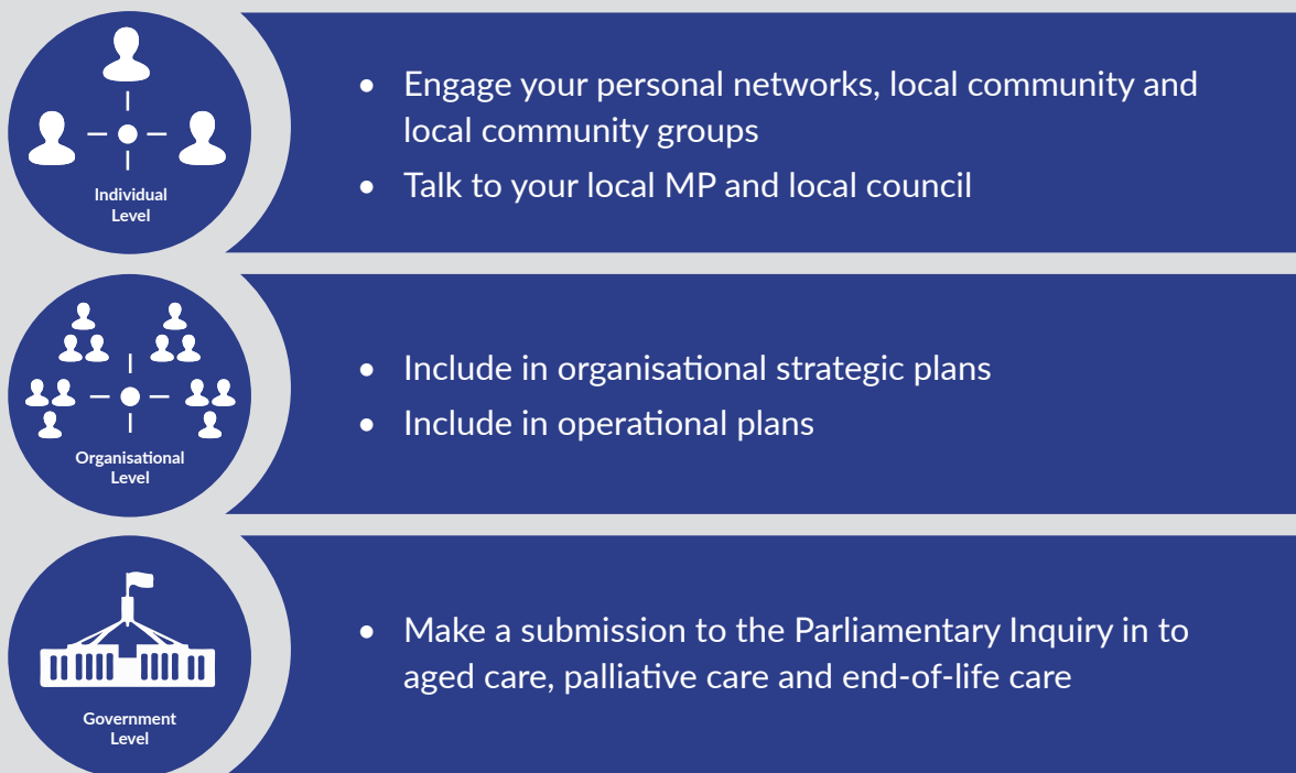
Figure 1 (below) shows opportunities for using the priorities.

Several other key documents have been developed Nationally over the past 12 – 18 months.